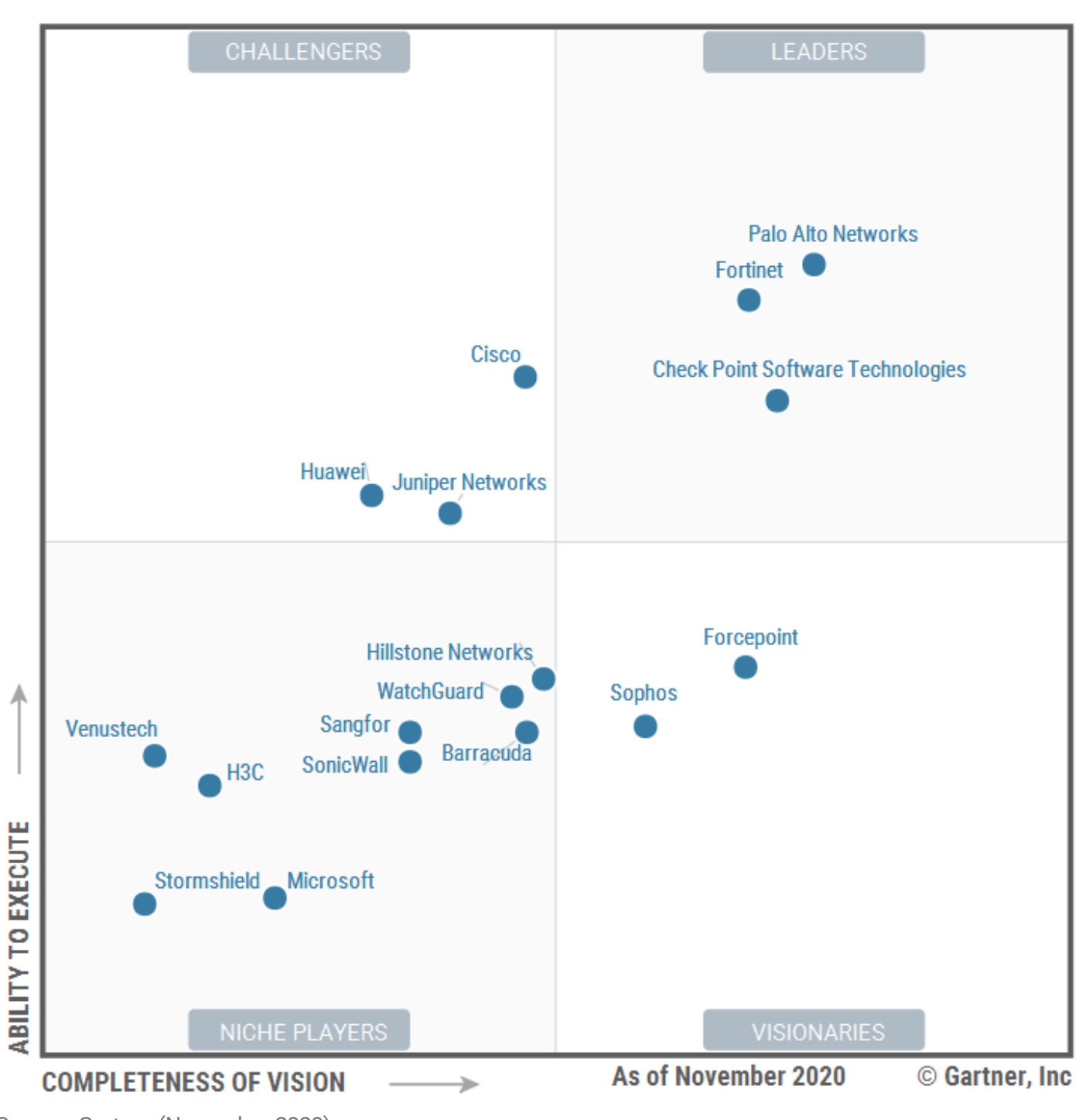
Figure 1. Magic Quadrant for Network Firewalls