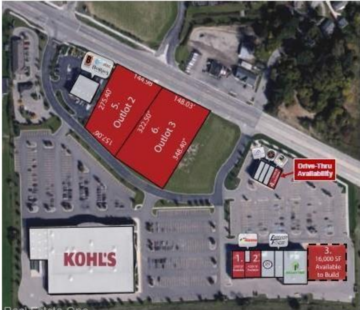
Proposed unit #1