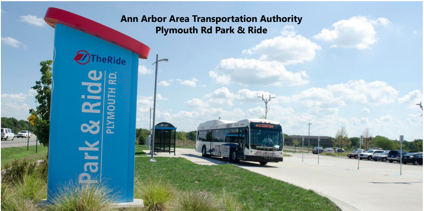
Ann Arbor Area Transportation Authority Plymouth Rd Park & Ride

Creating a centrally-located, designated space for passengers to get on and off buses and to transfer between different services would help facilitate connections both within and outside the County. A potential location for this hub would be near the I-96 / Grand River Avenue interchange, within the City of Brighton. Connections to LETS, Flint MTA, airport service, Ann Arbor commuter service, and a potential future Grand River Avenue bus route could all be made available from this location, provided that ADA accessibility and adequate parking are incorporated. Connections to the hub via sidewalks and bike paths, and amenities like bike storage would also foster greater interconnectivity between non-motorized transportation and transit. In the future, other mobility options including Uber/Lyft-type services and autonomous vehicles could also use the passenger hub.