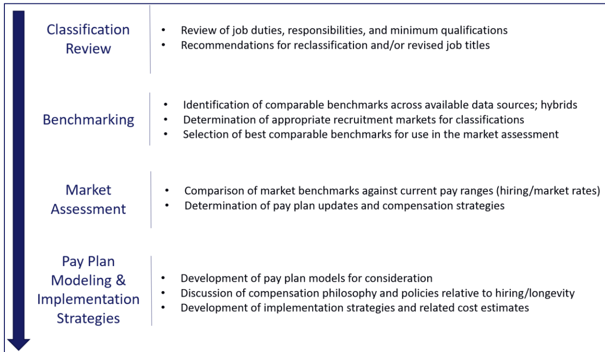
EXHIBIT 2-2: OVERVIEW OF REVIEW PROCESSES

MGT conducted an extensive review of Livingston positions relative to their job duties, qualifications, and responsibilities to determine any recommended position title updates or reclassifications. MGT also reviewed job descriptions/data and responses from the Management Issues Paper (MIP) survey to conduct the job review and to identify the appropriate recruitment markets and benchmark comparisons for determining any needed market adjustments and job updates. A database of all benchmark data reviewed during the study was provided to the Livingston Project Officer for reference and to support implementation and future maintenance and administration. Exhibit 2-2 provides an overview of MGT's process for assessing the County's positions, assessing market competitiveness, and developing pay plan recommendations.