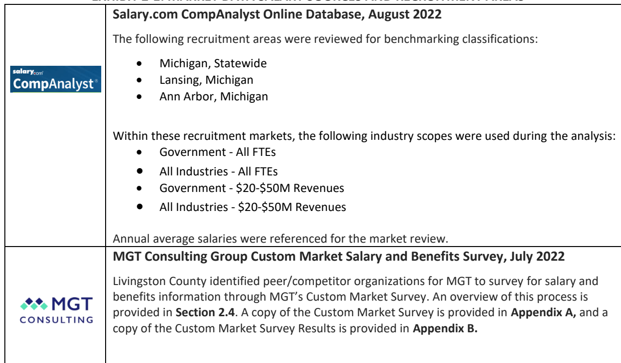
EXHIBIT 2-1: MARKET DATA SALARY SOURCES AND RECRUITMENT AREAS

Sources: Salary.com CompAnalyst database, 2022; MGT Consulting Group Custom Market Survey, 2022.