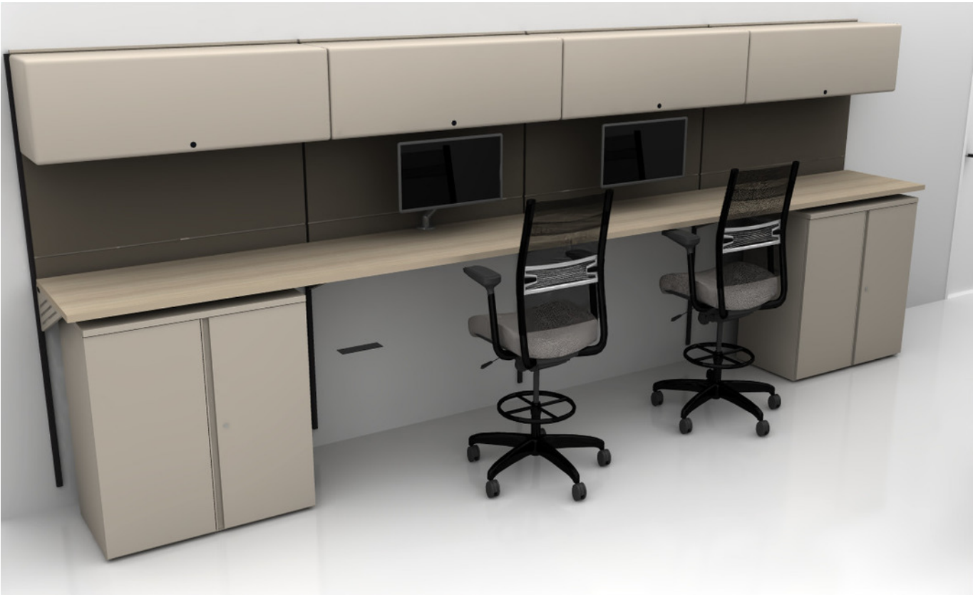
326- PROPERTY HALLWAY