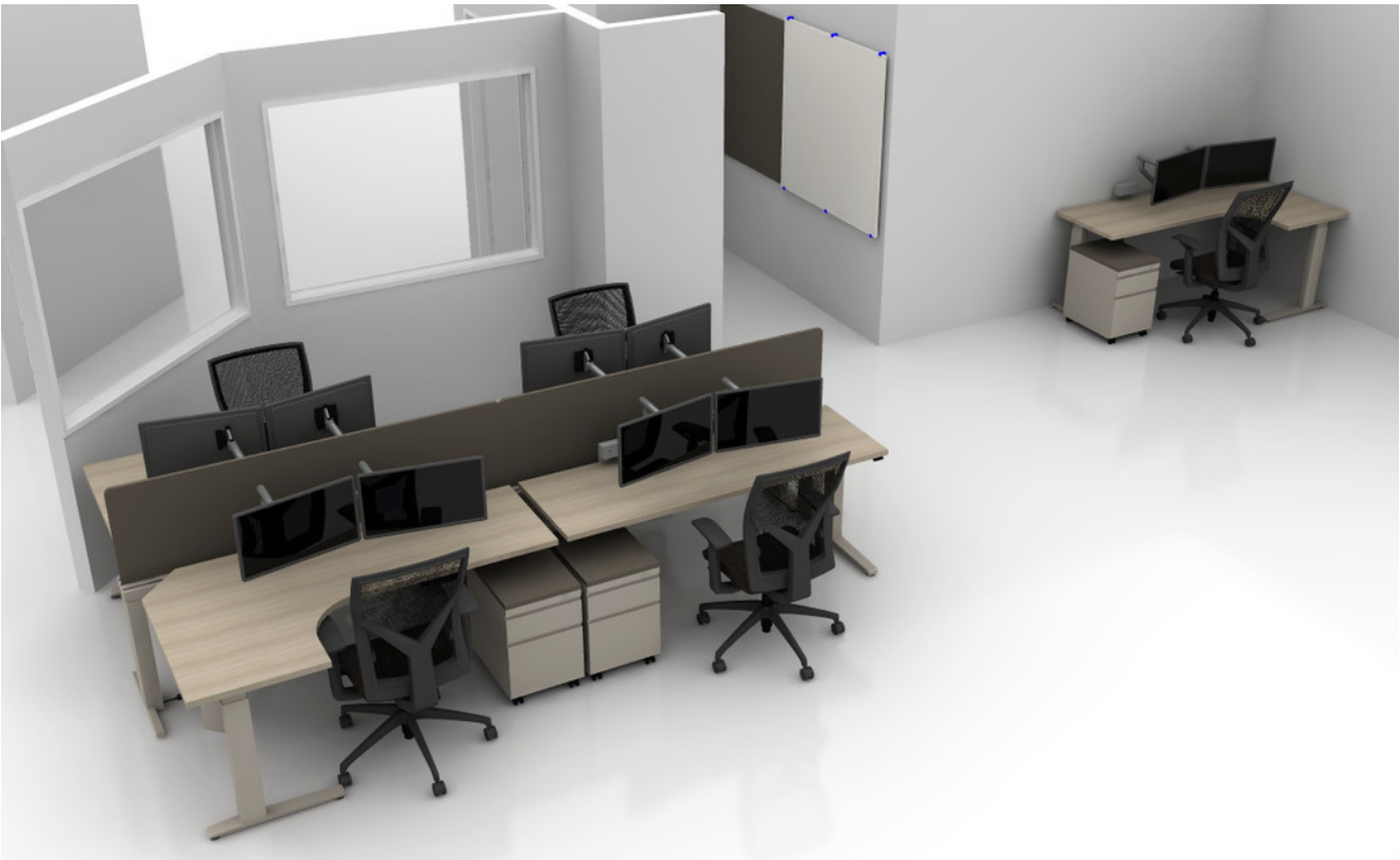
355- REPORT RM